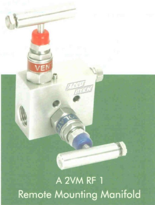
A 2VM RF 1